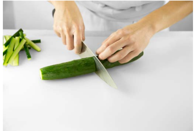
2. Cucumber – cut in half