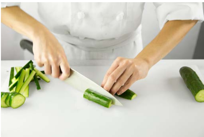
5. Cucumber - baton (strip) – cut into quarters lengthwise