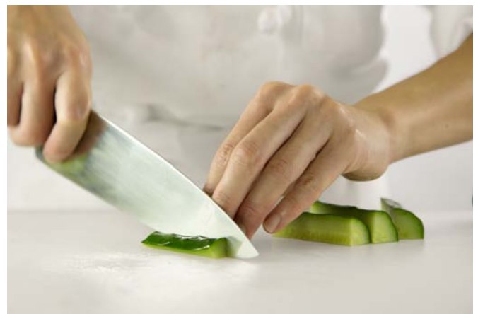
6. Cucumber – baton (strip) - cut into strips