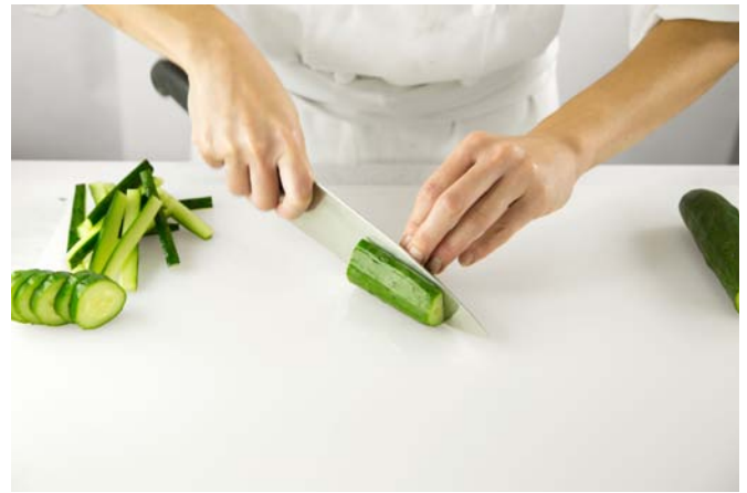
4. Cucumber – baton (strip) – cut in half lengthwise