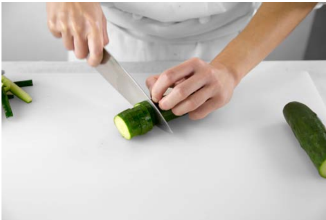
3. Cucumber – cut across into round discs or diagonally into ovals