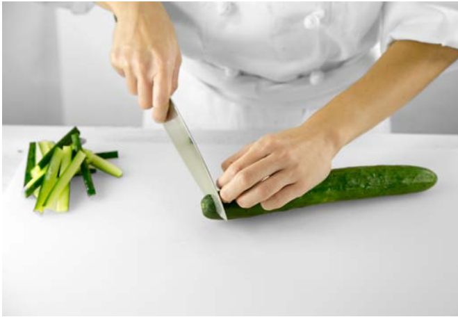
1. Cucumber – cut off both ends