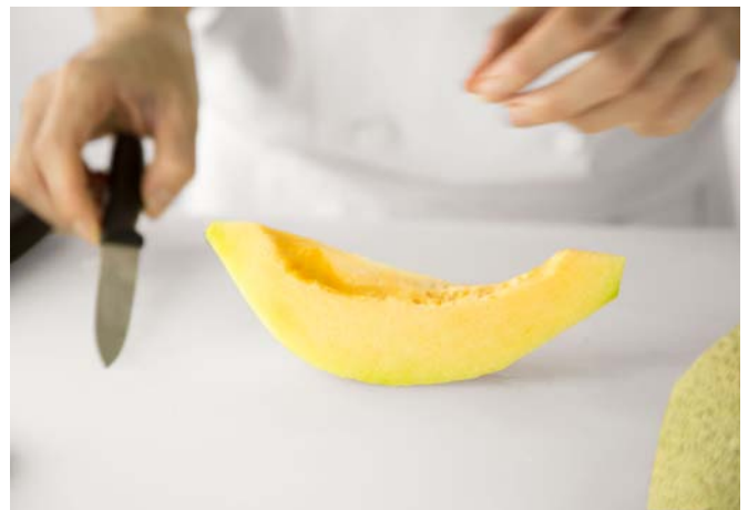
4. Cantaloupe cuts – slice