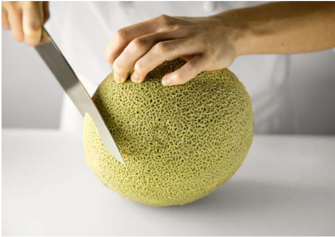
1. Cantaloupe cuts – remove both ends to create flat surface