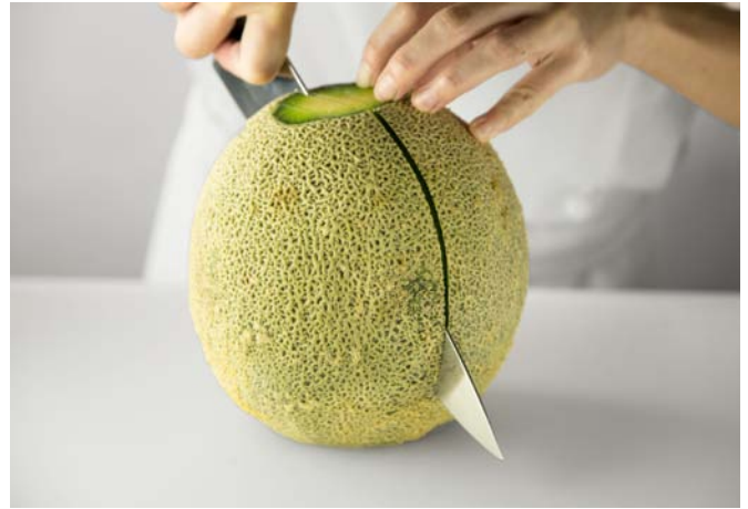
2. Cantaloupe cuts – cut in half