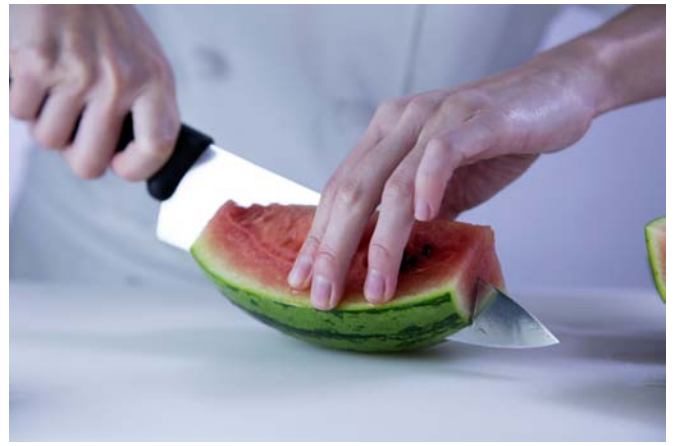
4. Watermelon cuts – cut quarter into slices