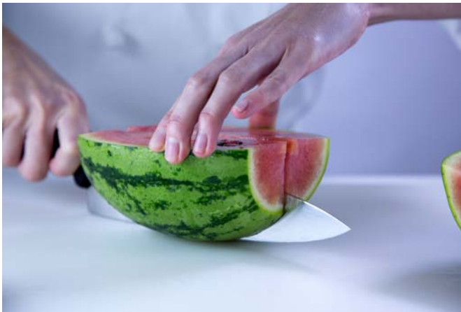
3. Watermelon cuts – cut into quarters