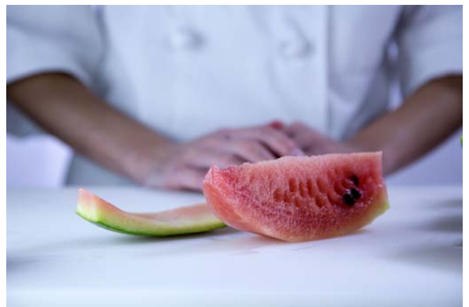
6. Watermelon cuts - slice