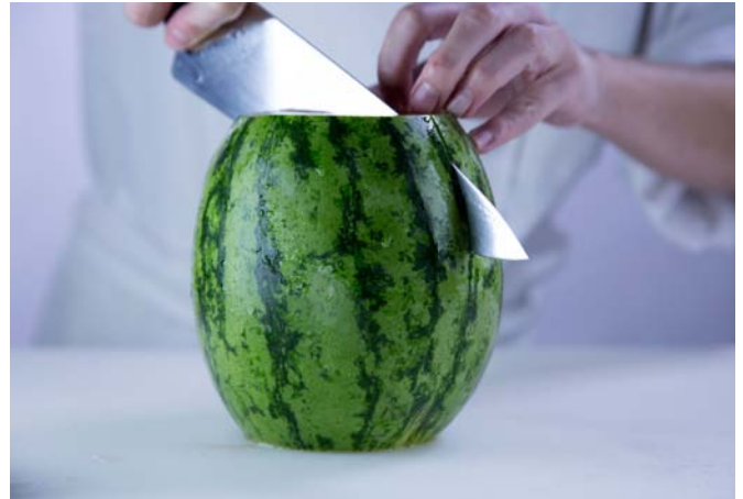
2. Watermelon cuts – stand on flat surface and cut in half