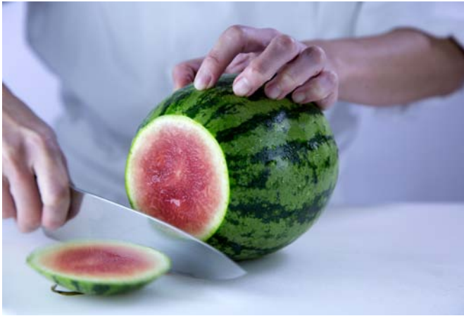
1. Watermelon cuts – cut off both ends to create flat surfaces