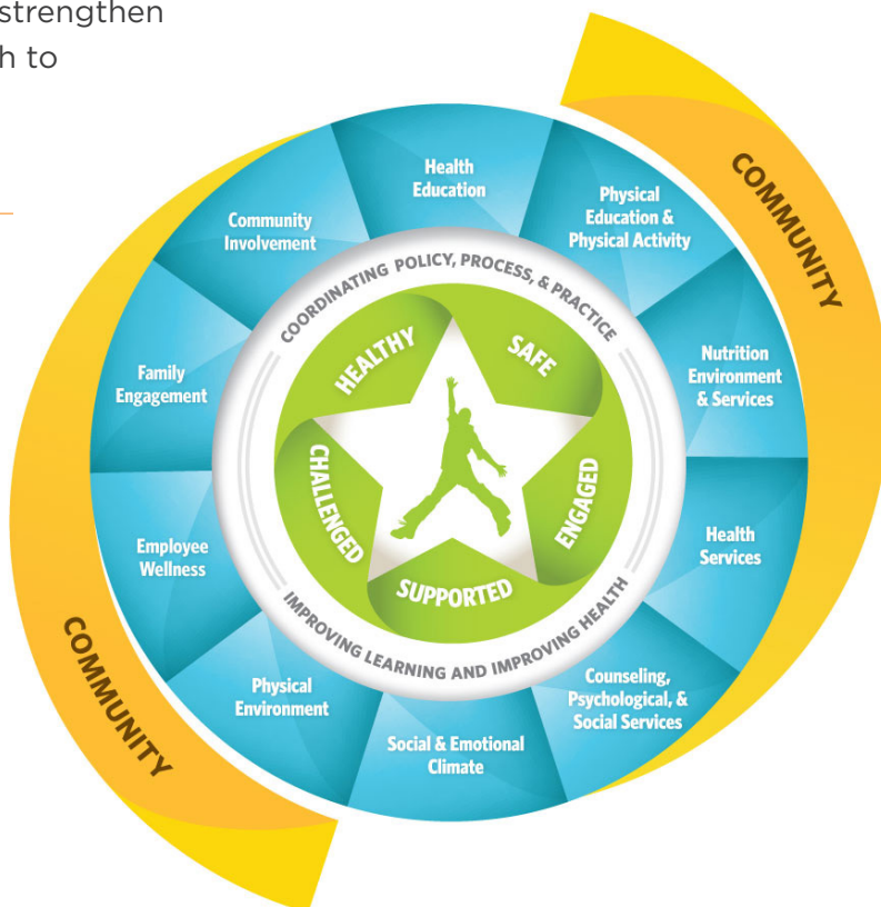
FIGURE 1 Whole School, Whole Community, Whole Child Model A Collaborative Approach to Learning and Health

Because the WSCC model was released in 2014 and ASCD’s Whole Child Initiative was already well-established in the education community, it is common for educators and others to refer to WSCC-related efforts as “Whole Child” initiatives rather than using the term WSCC. Although this can sometimes create some confusion, the essence and intent are the same. The term “WSCC model” is used throughout this guide, with the understanding that for some schools and school districts, Whole Child may be the phrase being used.